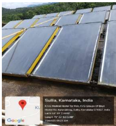
Sullia, Karnataka, India K.V.G. Medical Hostel for Men, K.V.G. Groups Of Boys Hostel Rd., Kuvempu, Sullia, Karnataka 574327, India Lat: 13° 39' 7.8832" Long: 75° 22' 43.0248" 100/021 09:23 AM