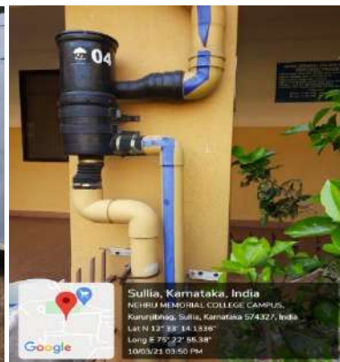
Sullia, Karnataka, India NRI MEMORIAL COLLEGE CAMPUS, Kuvempu, Sullia, Karnataka 574327, India Lat: 13° 38' 14.1336" Long: 75° 22' 45.38" 100/021 09:50 PM