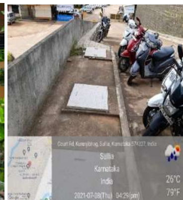
Court Rd, Kuvempu, Sullia, Karnataka 574327, India Sullia Karnataka India 26°C 79°F 2021-07-08 (Thu) 04:29 (pm)