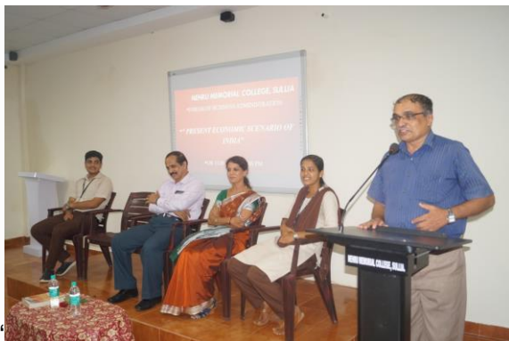
Present Economic scenario of India