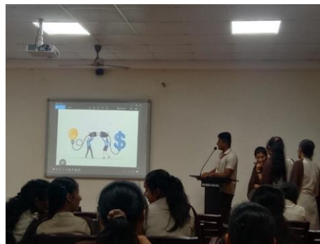
Critical thinking power