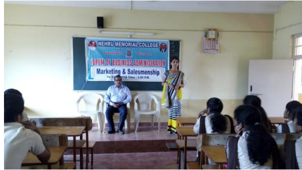
Marketing and Salesmanship