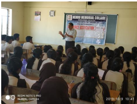
Programme on Preparation of project work