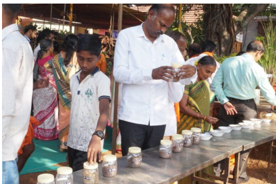
Information on Medicinal Plants