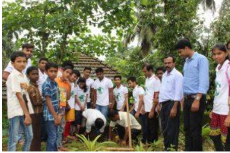
Hasiru Usiru ( Plantation)