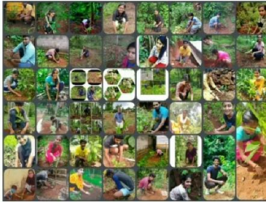
Planting sapling at home